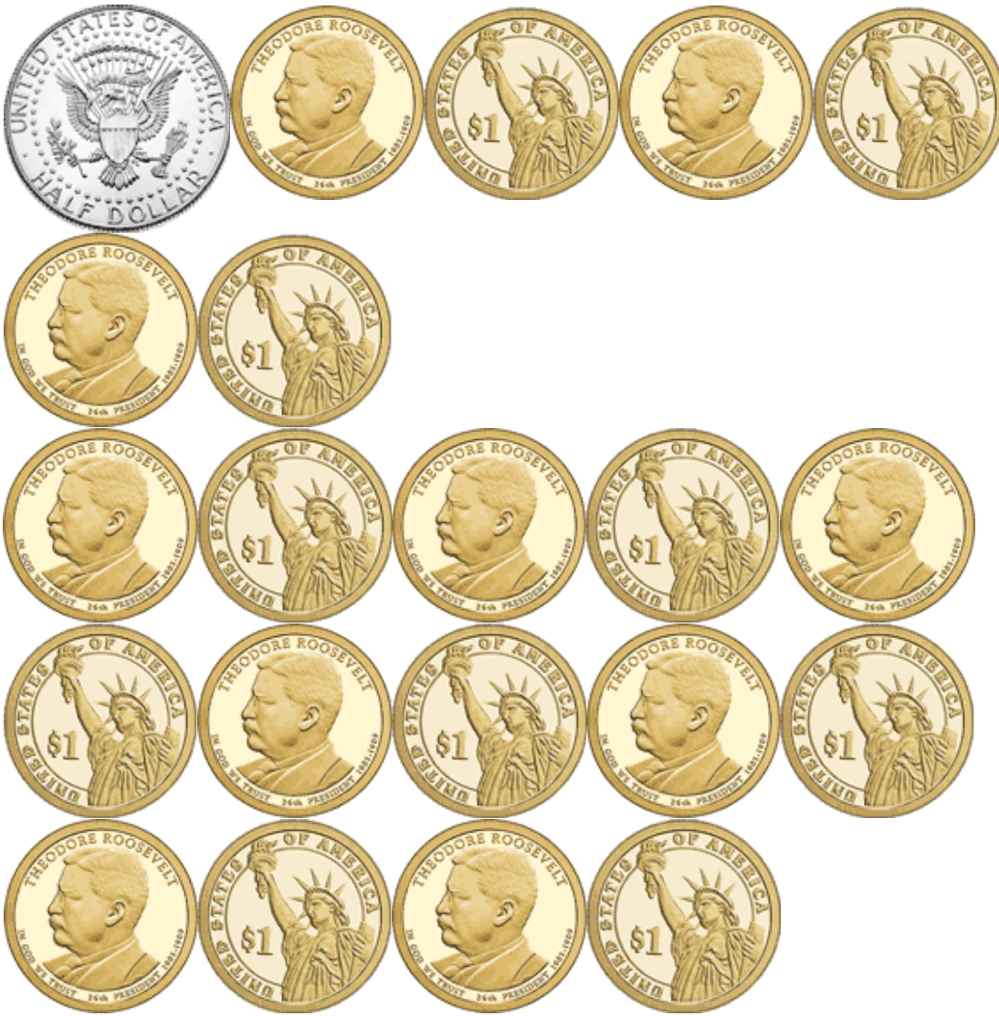
United States, Presidential $1, and Quarter-dollar coin images from the United States Mint.